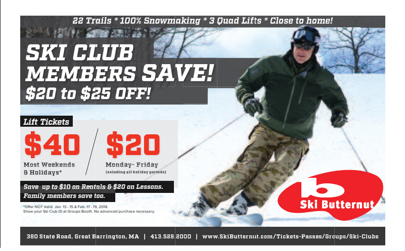
December 2017 • Page 3

Metropolitan New York Ski Council Newsletter